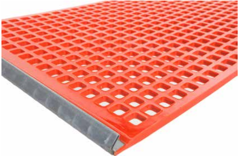
Durex ® Armor ® Screen Media

Economical, versatile and easy to install; the Armor ® screen is designed to increase throughput and reduce plugging. Combined with a high grade woven wire back-bone, it creates a strong highly wear resistant screen.