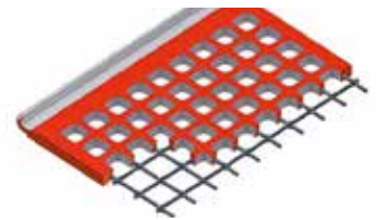
Wire Cloth with Molded Premium Polyurethane Armor ® Cover