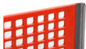
Easy, Side Tensioned Installation