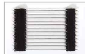
Type SR Straight Rubber

Durex® Armor® Screens protect your operation with the combined benefits of long wear life and high open area.