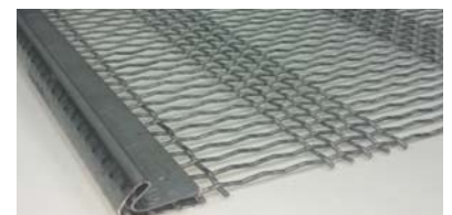
Durex® Inter-Crimp Slotted Wire Cloth