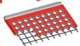
Durex® Armor® Screen Media