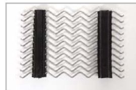
Type HR Herringbone Rubber