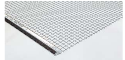
Durex® Woven Wire Cloth

The Inter-Crimp screen is designed to stay clean to avoid blinding. When compared to highbred screens, this product offers longer wear life, stronger screen panel and a lower cost alternative.