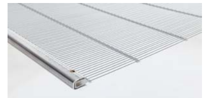
Vibraspan™ Long Slot Triple or Five Shoot Wire Cloth