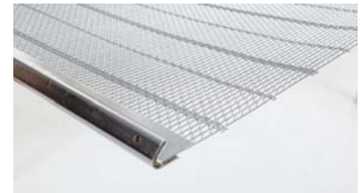
Durex® Accuslot™ Wire Cloth

Livewire® screens are a hybrid-type screen and available in four different opening styles for maximum output. Molded rubber strips hold high-strength wires in place, providing better screening action and greater open area.