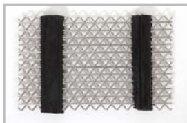
Type AR Accuslot® Rubber

Durex® Livewire® Wire Cloth is available in the four different open styles shown below: