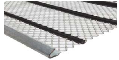
Durex® Livewire® DR Wire Cloth

Durex® Livewire® Wire Cloth is available in the four different open styles shown below: