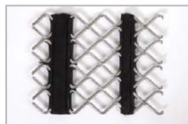
Type DR Diamond Rubber