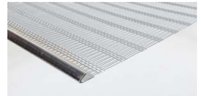
Durex® Long Slot Triple Shoot Woven Wire Cloth